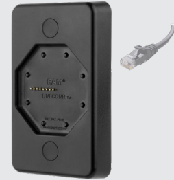
RAM-GDS-DOCK-W4-POEU GDS® Uni-Conn™ Powered Wall Dock with PoE