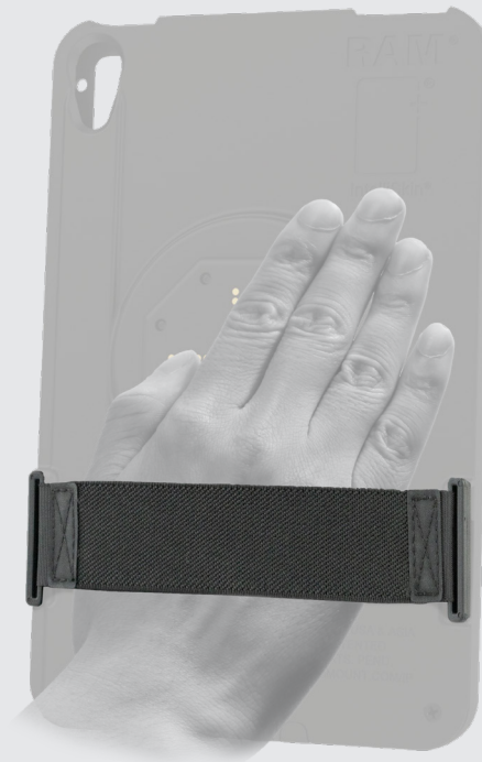
RAM-GDS-TC-HS1U GDS® Hand Strap for IntelliSkin® Thin-Case™ - Medium & Small Tablets