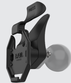
RAM-HOL-U1U RAM® Holder for Tablets with GDS® Uni-Conn™ Button