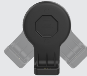
* RAM-GDS-DOCK-W3-POE GDS® Uni-Conn™ Wall Dock with Magnetic Receiver & POE