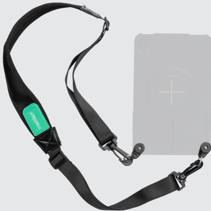
RAM-GDS-SS1-TCU GDS® Shoulder Strap Accessory for IntelliSkin® Thin-Case™