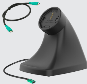
RAM-GDS-DOCK-D10K-C GDS® Uni-Conn™ Powered Kiosk Dock with USB-C