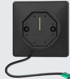
RAM-GDS-DOCK-D10V-C GDS® Uni-Conn™ Powered Uni-Conn™ Adapter with 75mm VESA Pattern