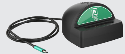
RAM-GDS-DOCK-D9U GDS® Desktop Dock with Power Delivery - Large Tablets