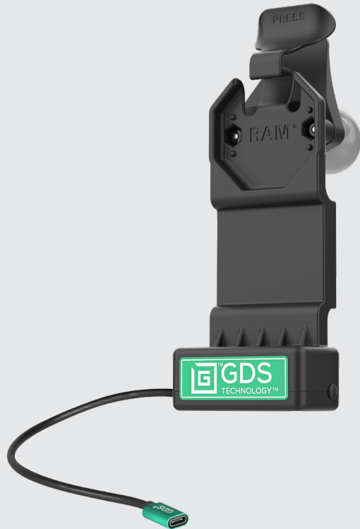
* GDS® Uni-Conn™ Powered Docks Comes in locking, non-locking, and variety of peripheral connections