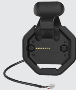
RAM-GDS-DOCK-U3JPU GDS® Uni-Conn™ Powered Snap-In Dock with JST Connector