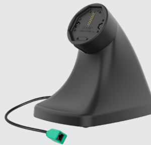
RAM-GDS-DOCK-D10K-POE GDS® Uni-Conn™ Powered Kiosk Dock with PoE