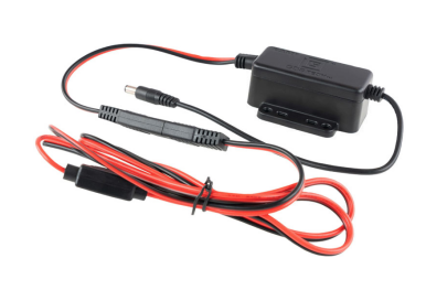
RAM-GDS-CHARGE-V9U GDS® 20-60VDC Input (12VDC Output) Hardwire Charger with Male DC 5.5mm