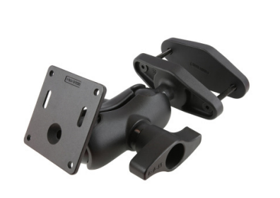
RAM-D-2461U-C-247-4 RAM® 4" Square Post Clamp Mount with 75x75mm VESA Plate