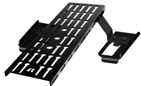
Leg kit above shown attached to RAM-VC-TP-29 (Top Plate)

For some installations, the leveling foot may be used as to level and stabilize the rear of the top plate. Simply choose the best location at the rear of the top plate and install as shown. The amount of space available after the console is attached as well as mounted accessories will determine where the leveling foot can be positioned.