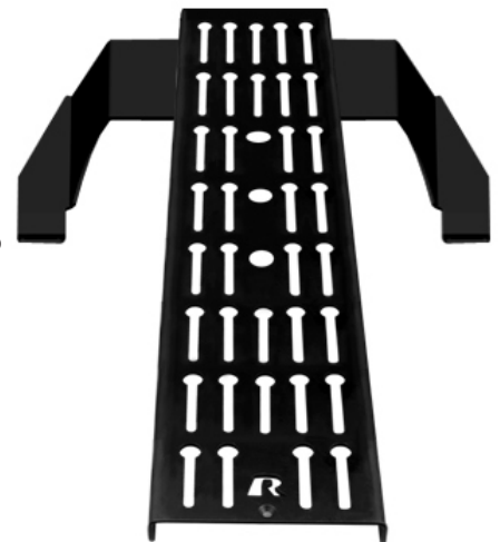
RAM-VC-LEG-102 (Leg Kit) shown attached to RAM-VC-TP-29 (Top Plate)