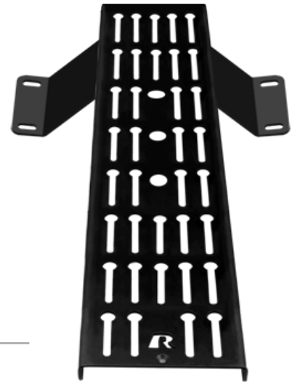
RAM-VC-LEG-101(Leg Kit) shown attached to RAM-VC-TP-29 (Top Plate)