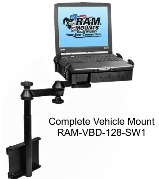
Complete Vehicle Mount RAM-VBD-128-SW1