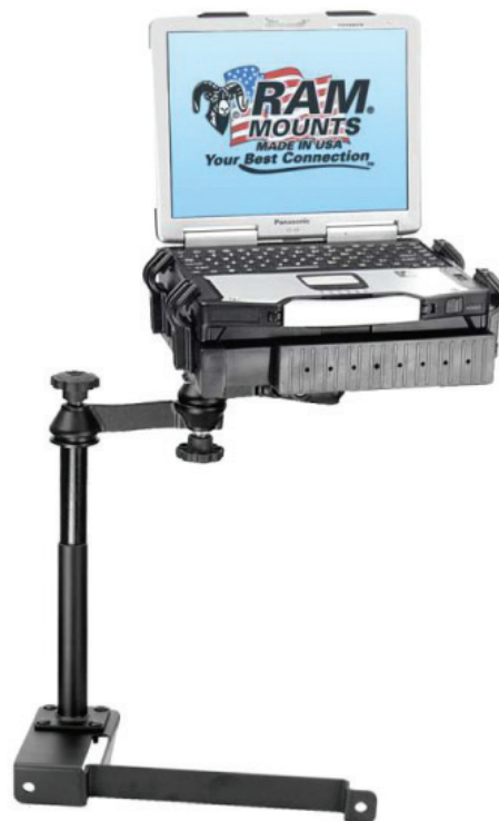
Complete Vehicle Mount RAM-VB-167-SW1

Installs in minutes with no drilling required Minimal intrusion into passenger leg space Lifetime warranty