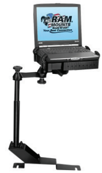
Laptop Vehicle System: RAM-VB-161R-SW1