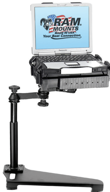
Complete Vehicle Mount RAM-VB-152-SW1