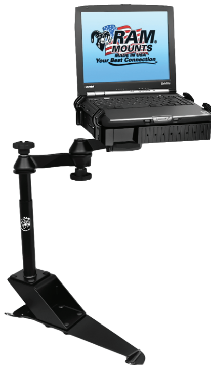
Complete Vehicle Mount RAM-VB-138ST1-SW1