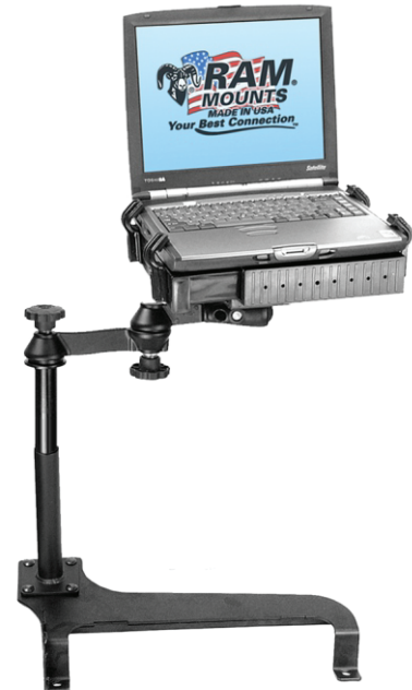
Shown In Use