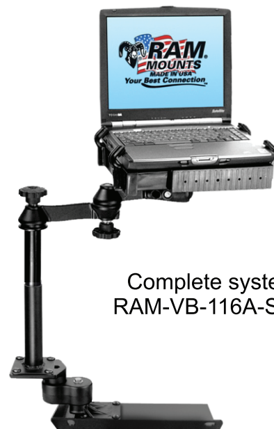
Complete system RAM-VB-116A-SW1

18mm & 19mm box end wrenchs, 18mm socket, 19mm socket, and socket wrench for base installation. Tools for complete system assembly: pliers, phillips screw driver, #10, 1/2", 9/16" box end wrench's.