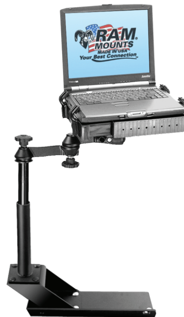
Complete Vehicle Mount RAM-VB-116-SW1