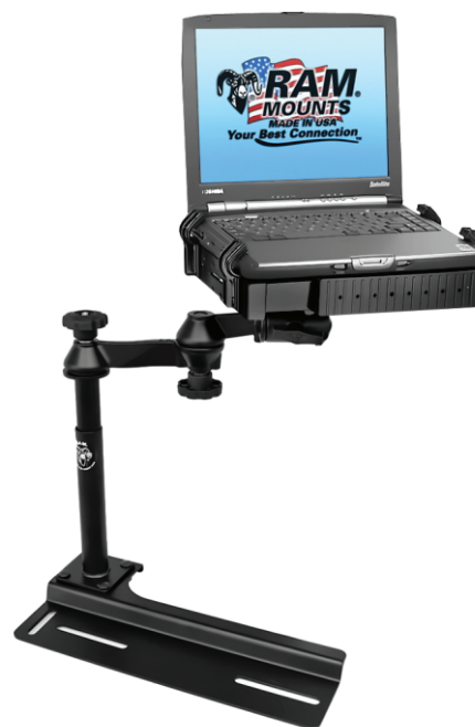
Complete Vehicle Mount RAM-VB-106-SW1

A = 17.63", B = 8.25", C = 1.13", D = 4" Hole Center = 10.625" min to 15.875" max