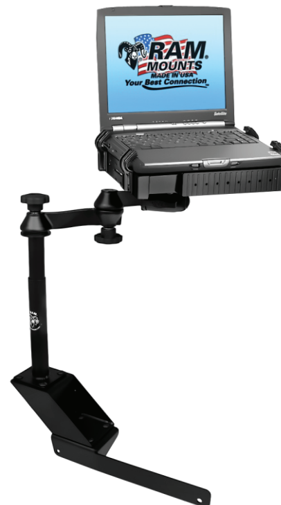
Complete Vehicle Mount RAM-VB-105-SW1