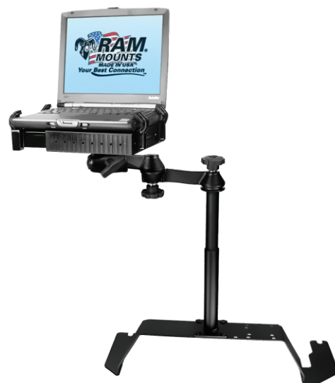
Complete Vehicle Mount RAM-VB-103-SW1