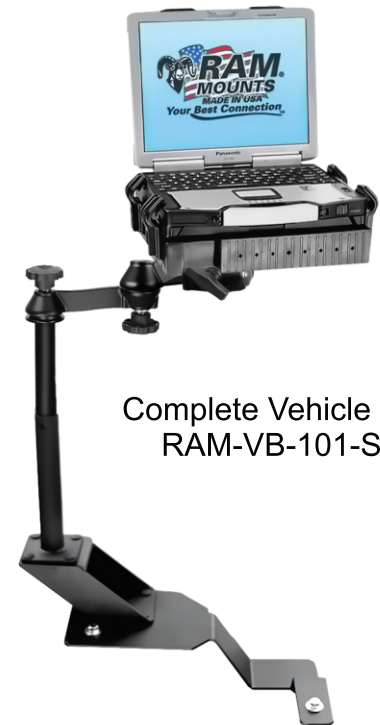
Complete Vehicle Mount RAM-VB-101-SW1