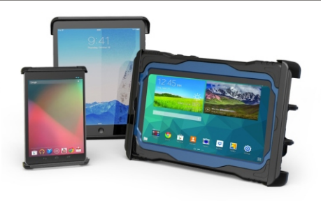
RAM® Tab-Tite™ Universal spring loaded holder for supporting virtually any size tablet

X-Grip™ II - Small Tablets P/N: RAM-HOL-UN8BU