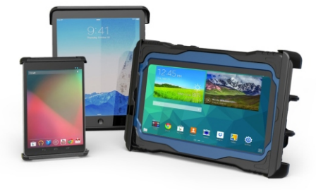
RAM® Tab-Tite™ Universal spring loaded holder for supporting virtually any size tablet